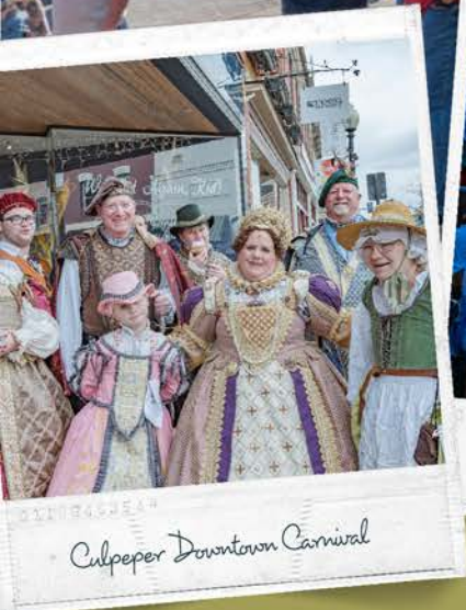
Culpeper Downtown Carnival