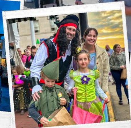
Culpeper Downtown Merchant Trick-or-Treating