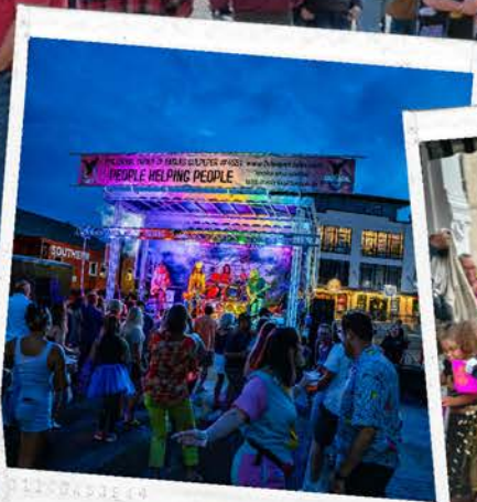
3rd Thursday Summer Concert Series