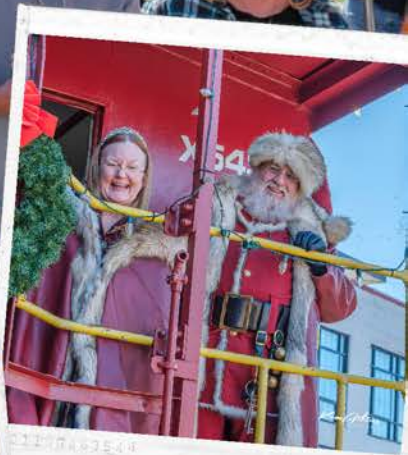
Culpeper Downtown for the Season